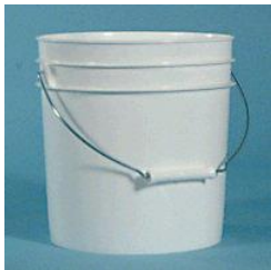
Water bucket to wash hands