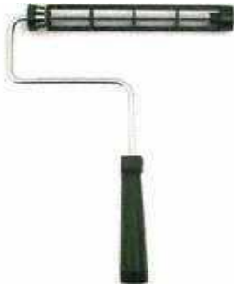
9" Heavy Duty Roller Frame