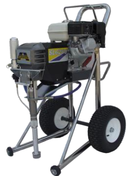
Airless Sprayer 3000 psi or Higher to spray SureCoat Roof System™ (Recommended, but optional)