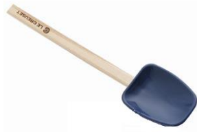
Spatula / to clean the SureCoat Roof System™ out of the buckets