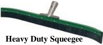
Heavy Duty Squeegee