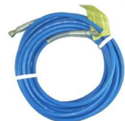
High-pressure hose With 3/8 id (Inside Diameter)