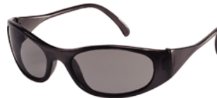
Safety glasses / UV protection