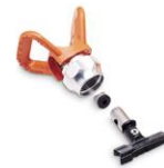
Use a reversible tip Tip size .33-.50