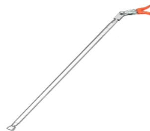
3ft. Extension Wand