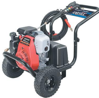
Pressure Washer 2500 p.s.i. or Higher