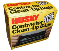
Clean up bags