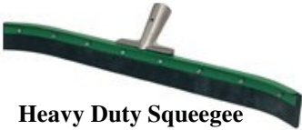
Heavy Duty Squeegee