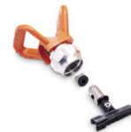
Use a reversible tip Tip size .33-.50