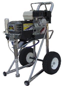
Airless Sprayer 3000 psi or Higher to spray SureCoat Roof System™ (Recommended, but optional)