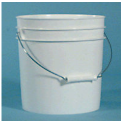
Water bucket to wash hands