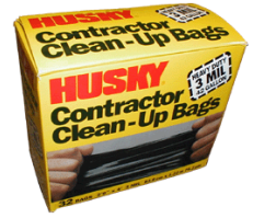
Clean up bags