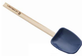
Spatula / to clean the SureCoat Roof System™ out of the buckets